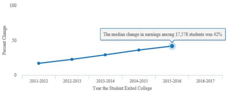
Statewide, SECTOR - Business and Entrepreneurship, 2016-2017